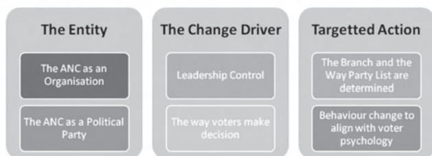
Public perceptions about the ANC

that there is no neat-formula. For purposes of discussions we must imagine variables and scenarios that transcend our historical characterisation of the ANC as a liberation movement and a party in government. Let us imagine a multi-faceted ANC with its ideology and values embedded in societal institution, and that is hegemonic in all social classes and strata.